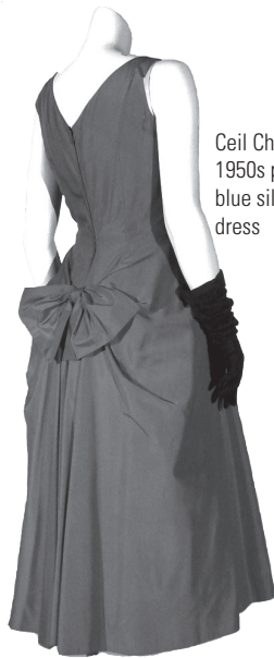
Ceil Chapman 1950s peacock blue silk satin dress