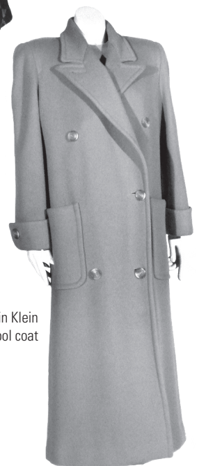
Calvin Klein tan wool coat