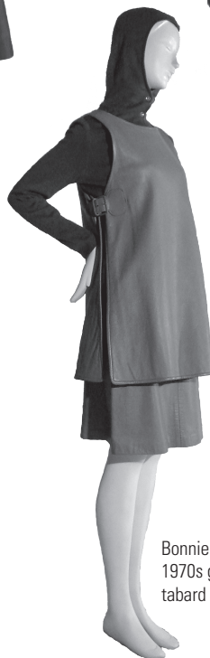
Bonnie Cashin 1970s green leather tabard and skirt