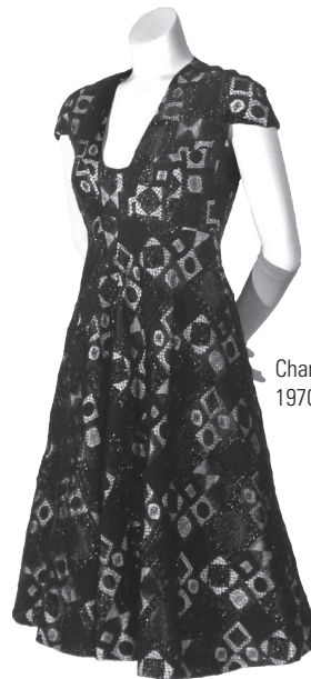
Charles Kleibacker 1970s black lace dress